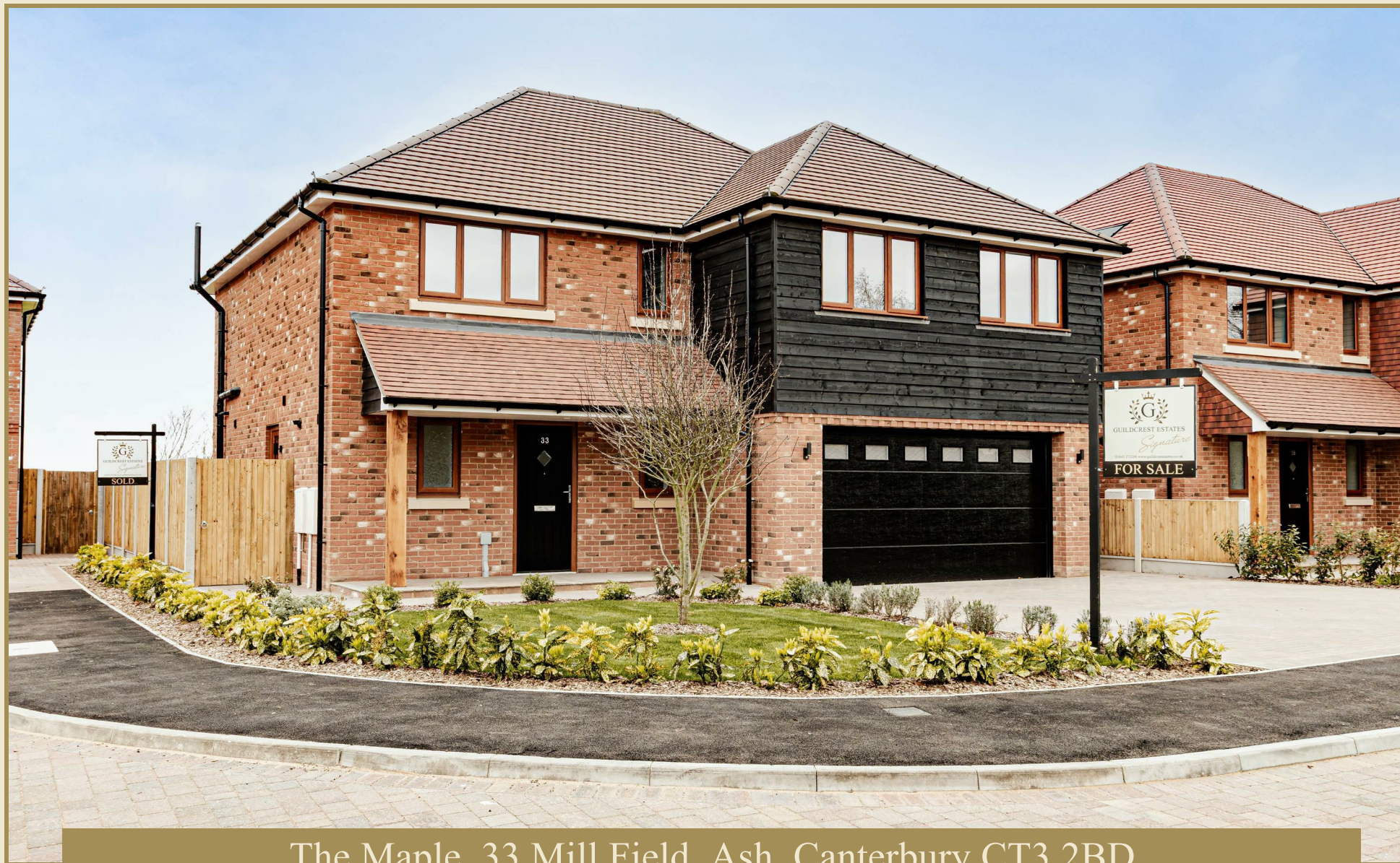
The Maple, 33 Mill Field, Ash, Canterbury CT3 2BD